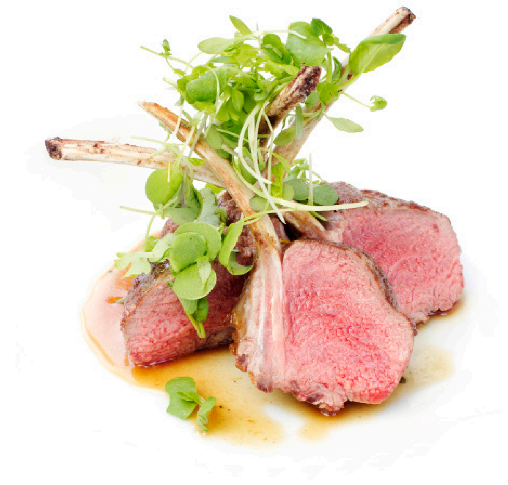
Example of Red Meat origin fingerprints

We can determine the origin of red meat products no matter where the animal was reared and at what stage of the supply chain the product is in.