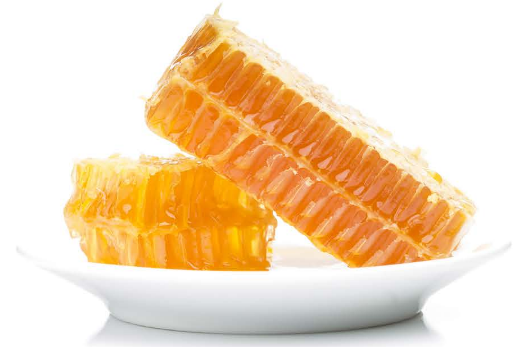
Example of Honey origin fingerprints

We have an extensive honey database with samples from throughout the world. New Zealand has an enviable reputation for quality honey which makes the product a target for fraud.